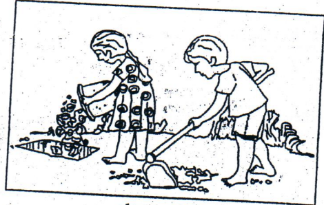
clean, sister *